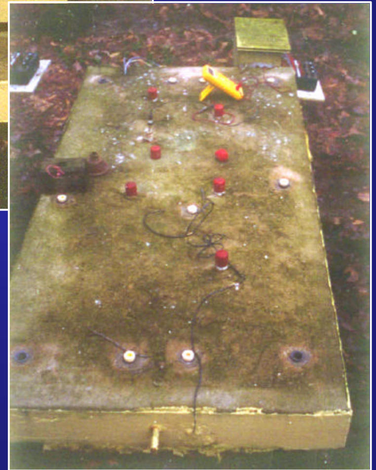
Views of test slabs when new.